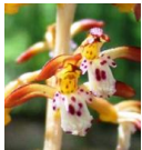
C. odontorhiza: Autumn Coral-root (both varieties) Bloom time: Mid Sept -mid Oct. Uncommon, easily overlooked.