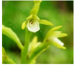
C. striata: Striped Coral-root Bloom time: Early - mid June. Uncommon, easily overlooked.