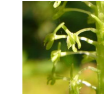
M. unifolia: Green Adders-mouth Bloom time: Late June - mid July. Common, difficult to find.