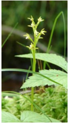
C. trifida: Early Coral-root Bloom time: Late May - mid June. Common, easily overlooked.