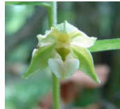
E. helleborine: Helleborine Bloom time: Mid July - early Aug. Common, easily overlooked.