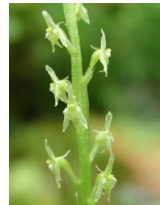
M. monophylla var brachypoda: White Adders-mouth Bloom time: Late June - mid July. Rare, difficult to find.