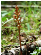
C. maculata: Spotted Coral-root Bloom time: Late June -mid July. Uncommon, easily overlooked.